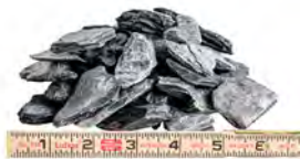
L-5 Landscape Stone Size: ¾" - 1½"

100 sq. ft. coverage per ton based on 1"-2" depth. Supersack available for all sizes.