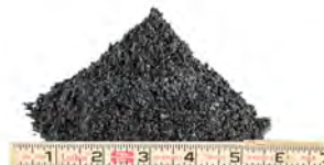
Black Slate Sand (washed) Size: ⅛" - and smaller