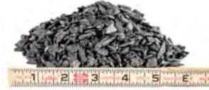
L-8 Landscape Stone Size: ¾" - ½"