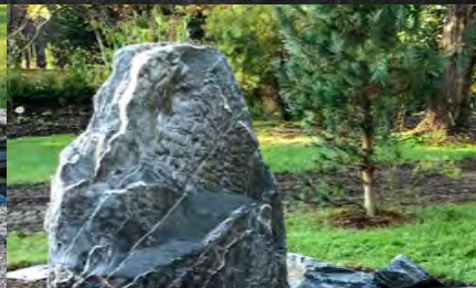
BOULDERS, SLABS & LANDSCAPING STONES