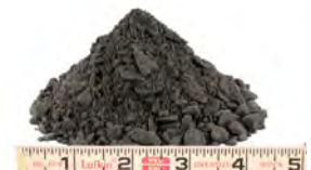
Trail Blend Size: ½" - and smaller with fines