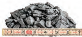
L-57 Landscape Stone Size: ½" - 1"