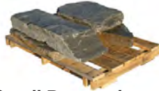
Small Decorative Landscaping Slabs Avg. size: 4"-8" High/2'-4' Long Avg. Qty per pallet: 4 to 6 pcs.