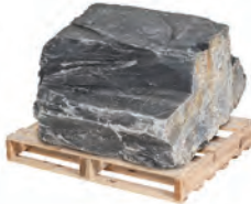
Large Decorative Landscaping Boulders Avg. size: 1000-2500 lbs. Avg. Qty per pallet: 1 pc.