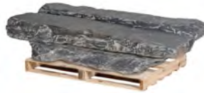
Large Decorative Landscaping Slabs Avg. size: 4"-8" High/6'-8' Long Avg. Qty per pallet: 2 to 3 pcs.