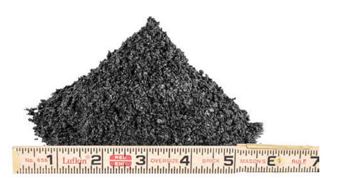
Black Slate Sand (washed) Size: 1/8" - and smaller