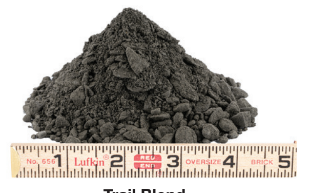
Trail Blend Size: ½" - and smaller with fines

Buckingham® Slate walls combine functionality with timeless beauty.