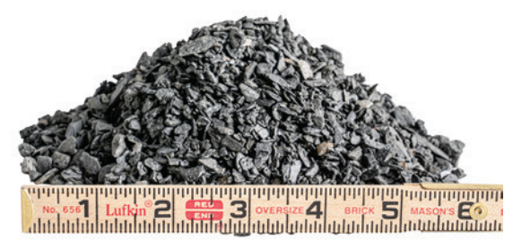
L-9 Landscape Stone Size: 1/8" - 3/8"