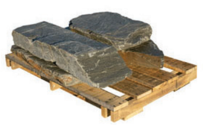
Small Decorative Landscaping Slabs

Avg. size: 200-500 lbs. Avg. Qty per pallet: 4-6 pcs.