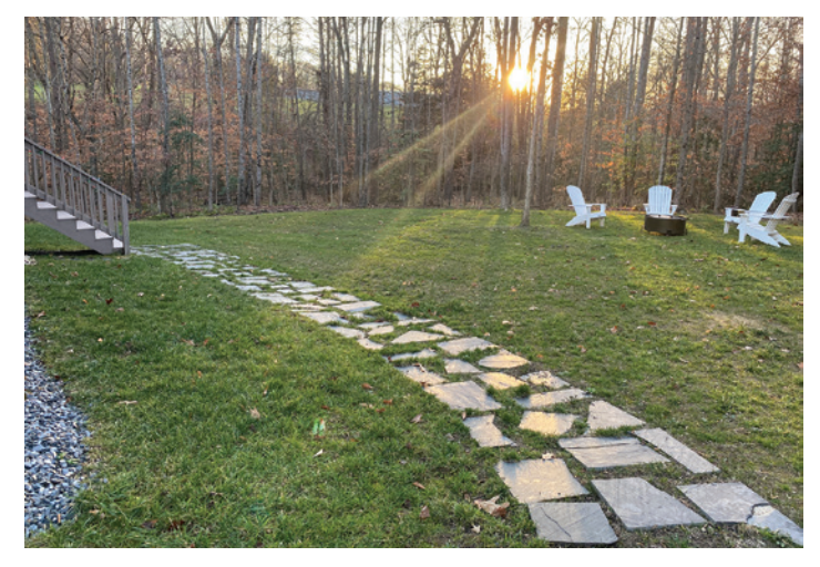
Buckingham® Slate Pathway Flagstone walkways and pathways are a charming, natural choice for navigating any landscape.