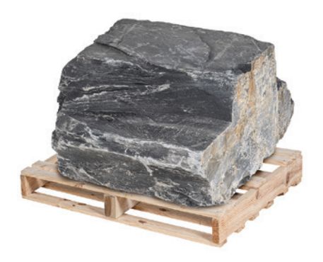
Large Decorative Landscaping Boulders

Avg. size: 4"-8" High/4'-6' Long Avg. Qty per pallet: 3 to 5 pcs.