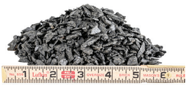
L-8 Landscape Stone Size: 3/16" - 1/2"