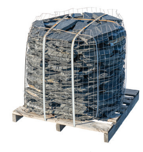
Versatile, small flagstone for small walkways and garden walls.