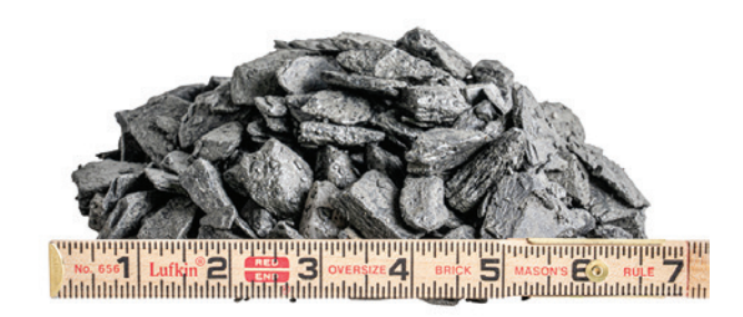
L-57 Landscape Stone Size: ½" - 1"