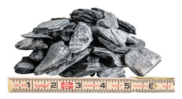
L-5 Landscape Stone Size: 3/4" - 11/2"

100 sq. ft. coverage per ton based on 1"-2" depth. Supersack available for all sizes.