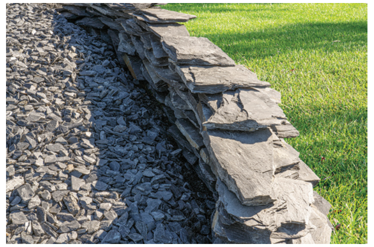
Mosaic Flagstone/ Dry Stack Wall Stone

Buckingham® Slate walls combine functionality with timeless beauty.